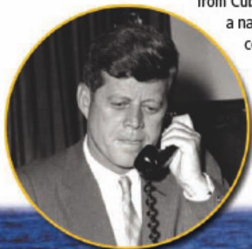
◀ U.S. President John F. Kennedy