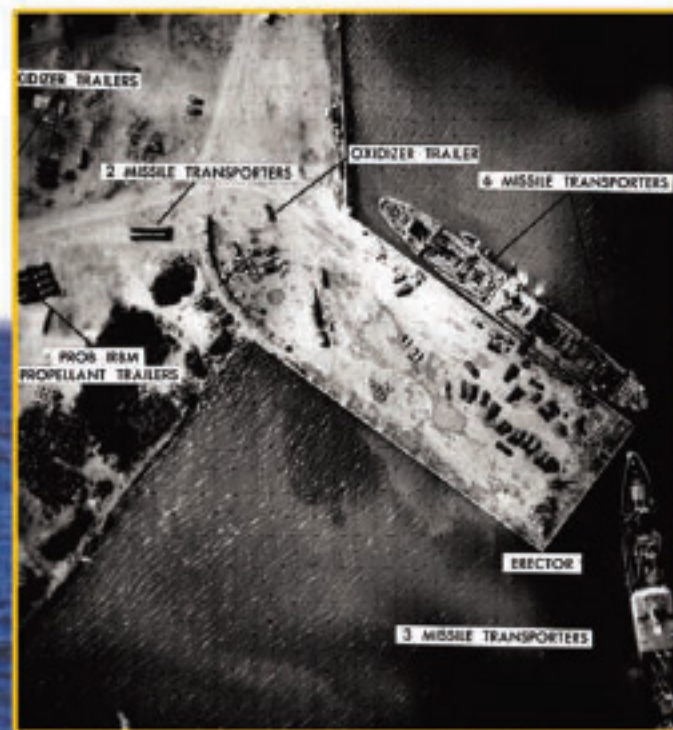
▲ This aerial photo shows Soviet missiles being unloaded at a Cuban port.