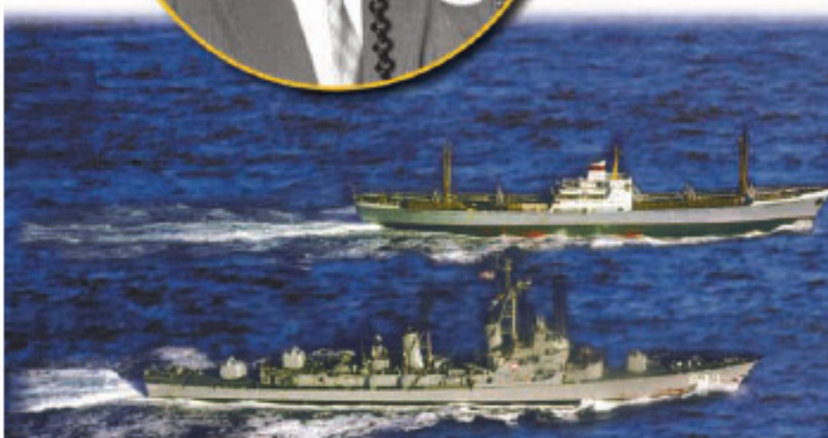
◀ During the U.S. naval blockade, the U.S. Navy surrounded Cuba with ships. (See the map below). In this photo, the USS Barry inspects the cargo of a Soviet freighter returning from Cuba.