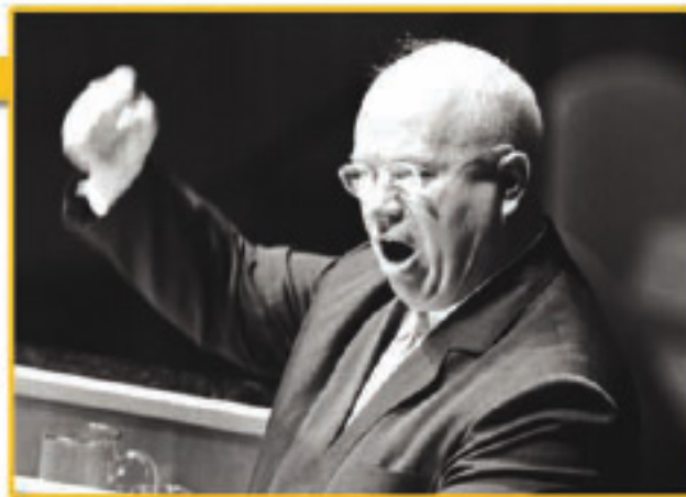
▲ Soviet Premier Nikita Khrushchev